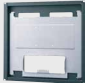
MB-527 Mounting Bracket (for LMD-2010SC)