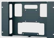
MB-526 Mounting Bracket (for LMD-1410SC)